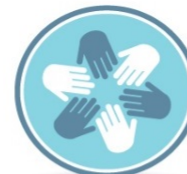
RESPONSIBLE SUPPLY CHAINS & HUMAN RIGHTS