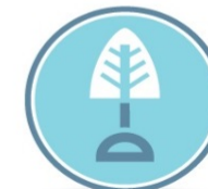
RESPONSIBLE MINING SECTOR