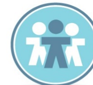
LABOUR RIGHTS & WORKING CONDITIONS